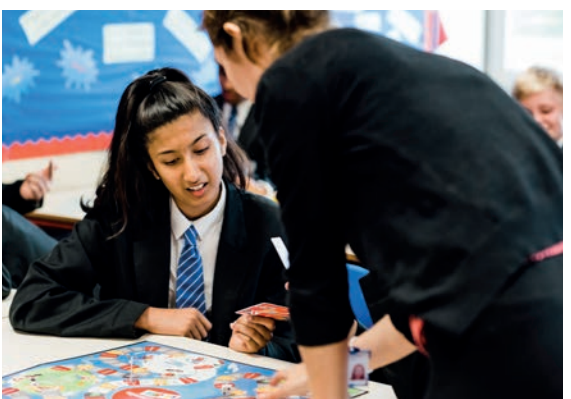
'Lack of tolerance of bullying is made clear right from the start' Parent Forum