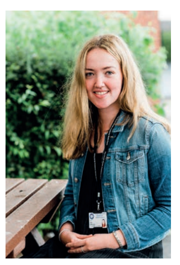
"My enthusiasm and confidence levels for my subjects has grown over my time in the sixth form thanks to the brilliant teaching and support I have received."