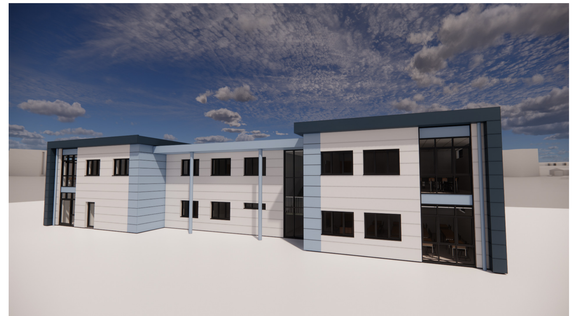
6 Rear 3D View 1 : 1