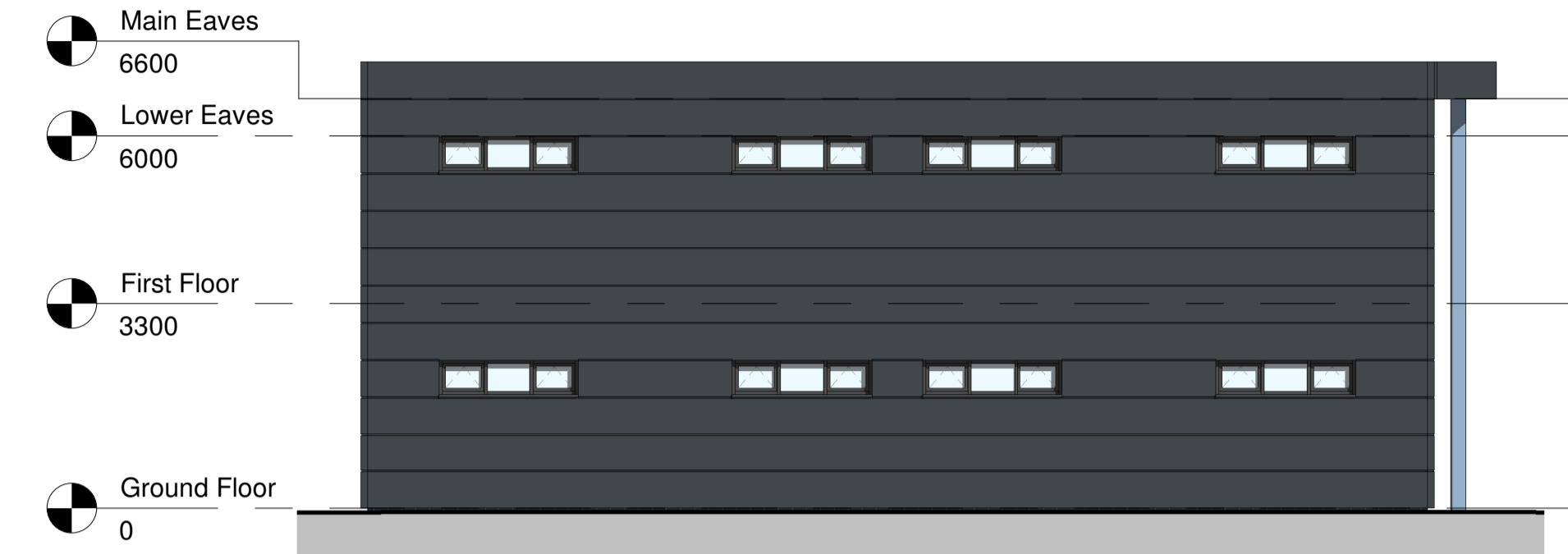
2 South Facing Elevation 1 : 100