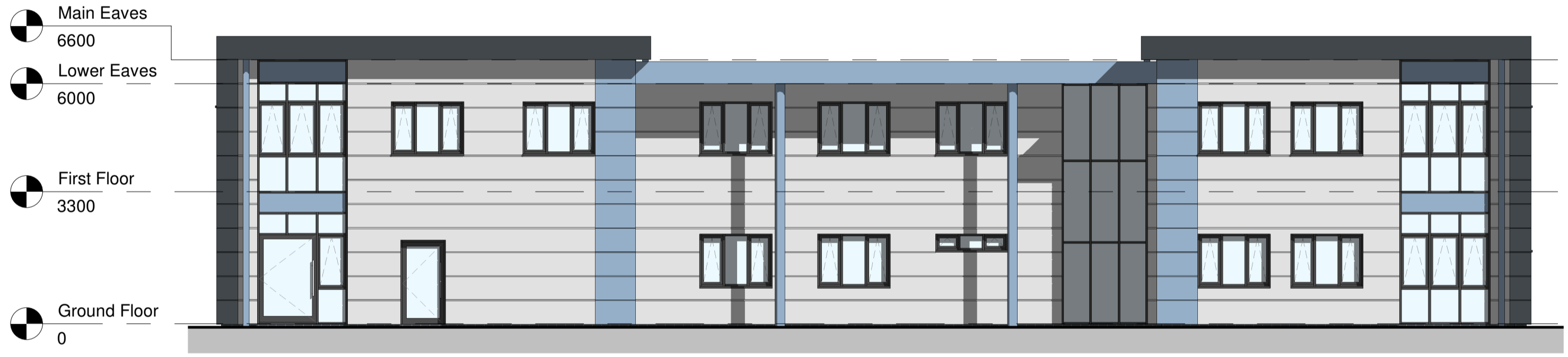
3 West Facing Elevation 1 : 100