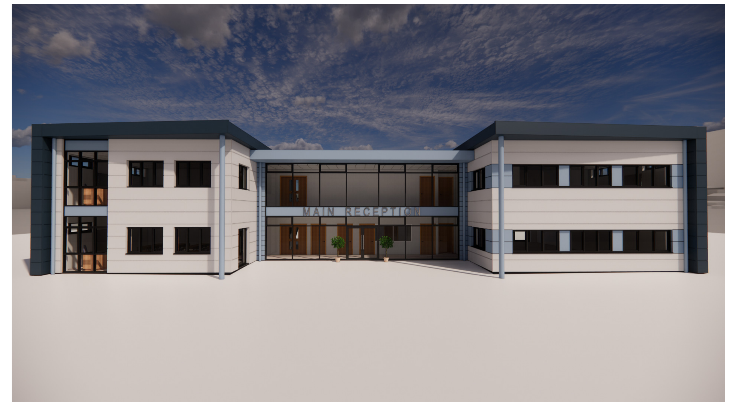
5 Front 3D View 1 : 1

All materials subject to local planning authority approval prior to placement of orders or implementation on site